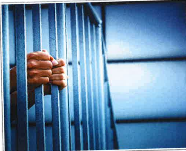
Journalists seeking to expose corrupt intelligence operations could face 10 years in jail.

Executive governments are notoriously unwilling to permit such conduct to be exposed, and the whistleblower role has usually been assumed by the press, whose critics are generally unwilling to acknowledge the unpalatable fact that, for all their imperfections, the